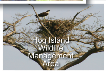
Hog Island Wildlife Management Area