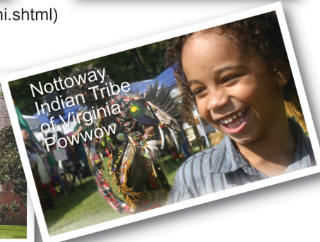
Nottoway Indian Tribe of Virginia Powwow