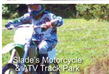
Slade's Motorcycle & ATV Track Park