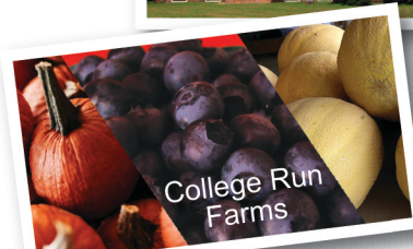
College Run Farms