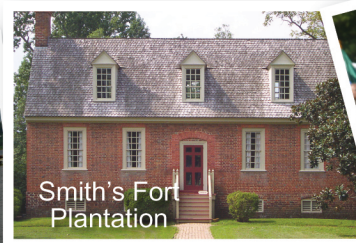
Smith's Fort Plantation