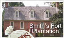
Smith's Fort Plantation